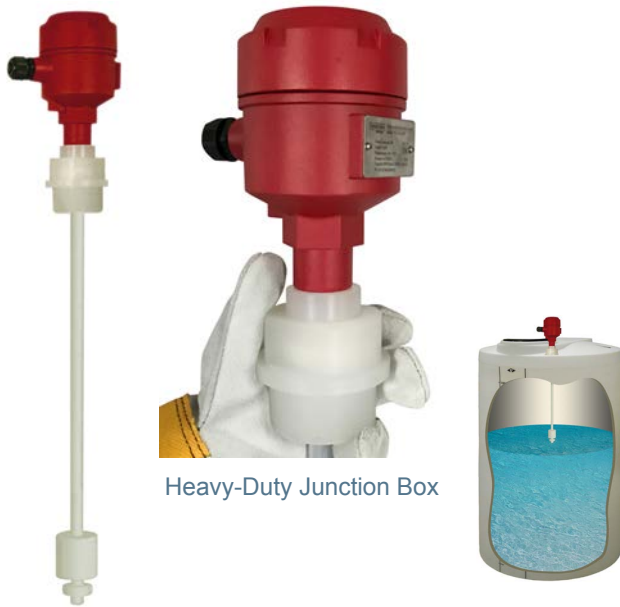
Heavy-Duty Junction Box

The CFL Series Continuous Float Level Transmitter uses a plastic float that contains a magnet inside, the linear movement is in direct relation to the liquid level being measured. The movement of the float excites the divider circuit that is located inside of the stem which is then converted into a analog 4-20mA output signal.