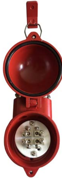
Easy Access Clamshell Design 4-Pole Electrical Connection