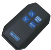
IR Remote Controller RIS-15