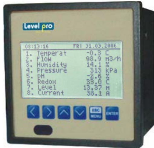
An example of what the display looks like