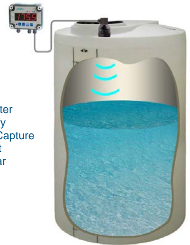
Special Horn Adapter Designed to Amplify Sound Pulse and Capture Echo* An Excellent Alternative to Radar